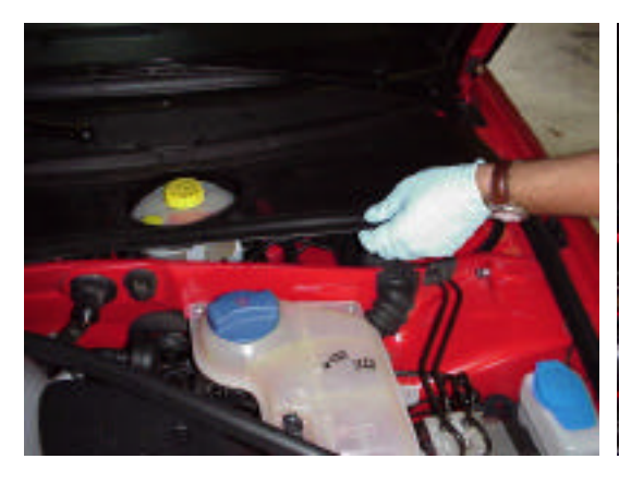
Step 3: Lift and Pull Plastic Cover Away from Windshield.

Remove weather-stripping by gently but firmly pulling towards front of car.