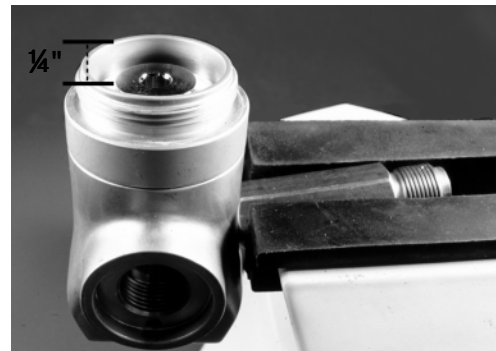
Figure 8 Adjustment Screw Pre-setting