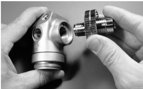
Figure 10 Installing DIN Connector Assembly