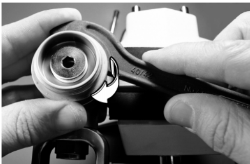
Figure 11 Tightening Diaphragm Clamp

DO NOT use a CO 2 cartridge that has not been discharged. Doing so may cause the cartridge to rupture, possibly resulting in serious injury.