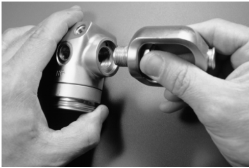
Figure 9 Installing Yoke Clamp Assembly