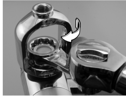
Figure 12 Torquing Yoke Connector

Failure to cycle the regulator during adjustment can result in a false reading of the intermediate-pressure.