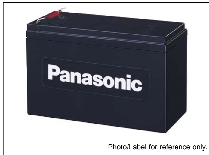
Photo/Label for reference only.